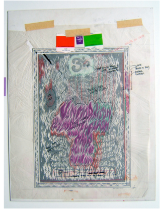
Fig. 8. Key-line mechanical. Black ink on illustration board (left), color pencil on tracing paper overlay (right). Wes Wilson, FD-88, poster for Van Morrison, Daily Flash, and Hair, 1967

printing had a way of clearly indicating or separating the design elements according to each color that was to be printed. The three methods primarily used to make the rock posters were acetate overlays, key-line mechanicals, and bluelines.