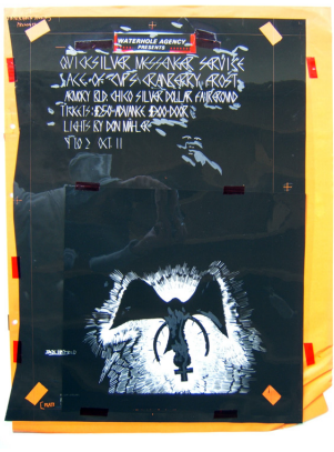
Fig. 11. Flat. Front showing windows cut out of opaque masking paper revealing negatives (left), back of flat showing cut pieces of negatives taped together (right). Jack Hatfield, poster for Quicksilver Messenger Service, Ace of Cups, and Cranberry Frost, 1967