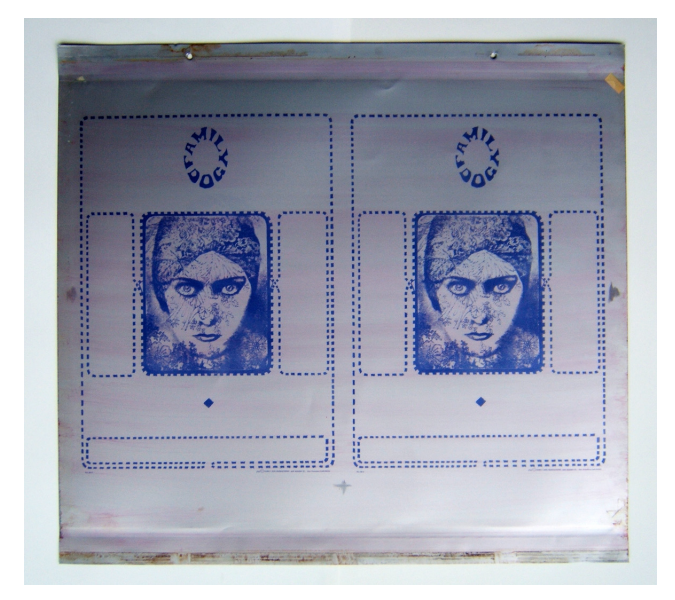
Fig. 12. Printing plate. Stanley Mouse and Alton Kelley, FD-30, poster for Big Brother & the Holding Company, and Sir Douglas Quintet, 1966

was placed in direct contact to the sensitized surface (emulsion to emulsion) and secured in a vacuum frame. The plate and the negatives were then exposed to a light source with strong ultraviolet output. The exposed image areas of the light sensitive surface were hardened and the unexposed material was removed during development. After rinsing, the plates were ready for printing.