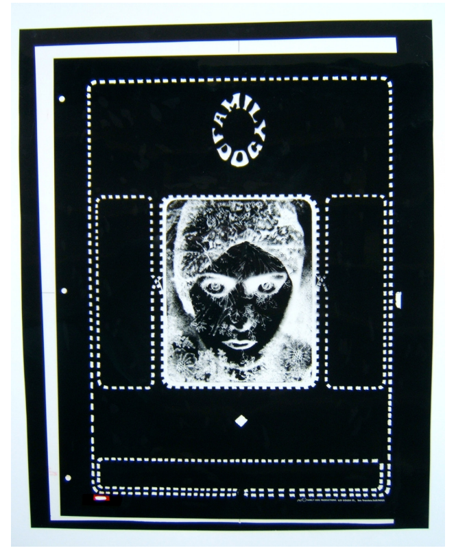
Fig. 10. Negative. Stanley Mouse and Alton Kelley, FD-30, poster for Big Brother & the Holding Company, and the Sir Douglas Quintet, 1966

The finished mechanical and all its overlays were photographed individually on a copy stand. The mechanical was held in place at one end by a copyboard, and the film was inserted at the other end in a film holder. The film used to shoot the artwork was made especially for graphic arts production work. As the film was high-contrast, all