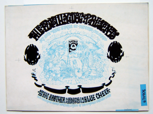
Fig. 9. Black ink drawing on illustration board (top), blueline print and black ink on illustration board (bottom). Rick Griffin, FD-79, poster for Big Brother & the Holding Company, Blue Cheer, and Eighth Penny Matter, 1967

photographed to make a negative. The resulting negative was then contact-printed on illustration boards or papers sensitized with diazo salt compounds to produce several blueline images. Then, working from these identical blueline images, the artist used black ink to demarcate the design elements corresponding to different colors (fig. 9). The beauty of the blueline is that when the paste-up is photographed, the blue is not recorded by the orthochromatic graphic arts film. Thus, the negatives produced showed only the design elements inked by the artist.