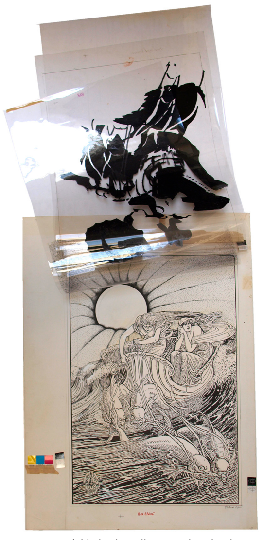
Fig. 6. Paste-up with black ink on illustration board and acetate overlays. Robert Fried, FD-D14, poster for Canned Heat and Siegal Schwall, 1967