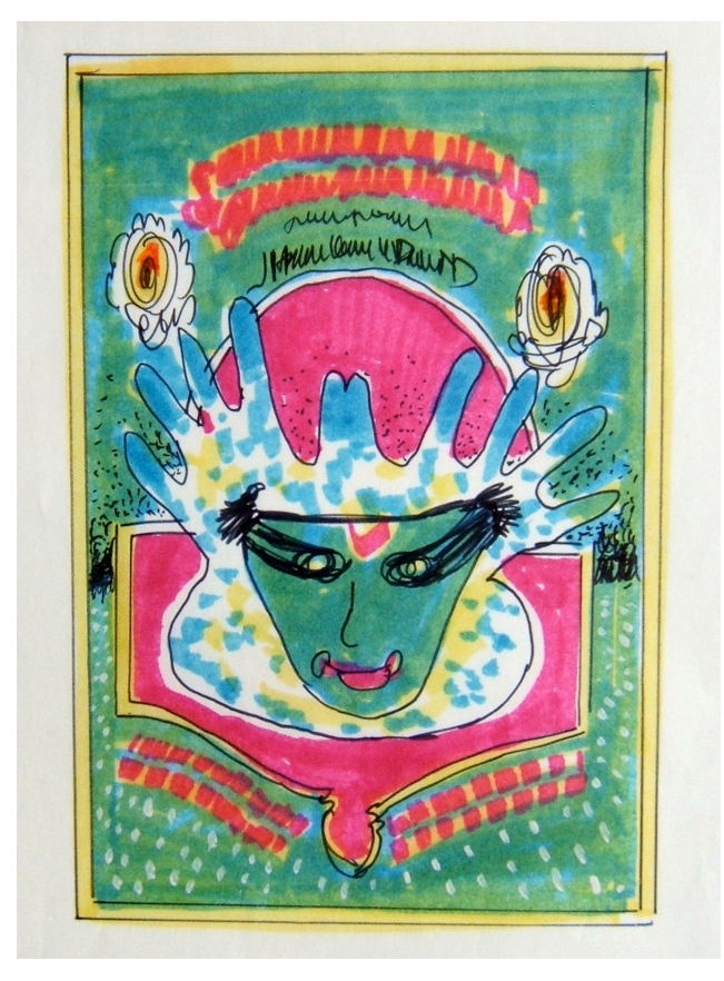
Fig. 5. Felt tip marker sketch on paper. Robert Fried, FD-115, poster for Steppenwolf, Charley Musselwhite, 4th Way, Indian Head Band, 1968

Before the actual printing of the rock posters, there was what was known as the pre-press work, which was accomplished using a series of complex photomechanical techniques. Pre-press work began with design and layout done by the artist. The finished artwork, including illustrations and photographs, was assembled by the artist into what was termed a paste-up or mechanical. The cameraman photographed the finished paste-up, producing transparent film negatives and