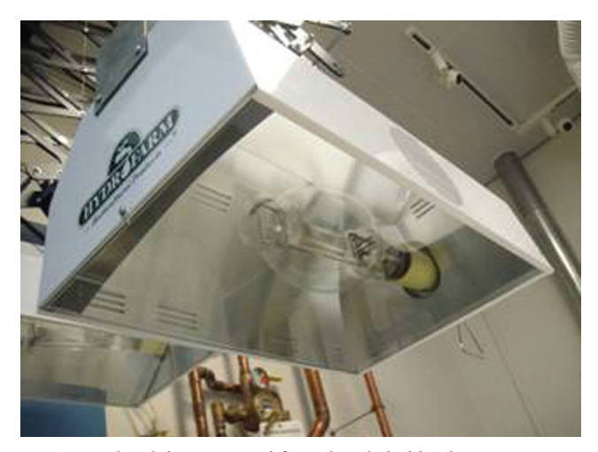
Fig. 1. Metal Halide Lamp used for indoor light bleaching

On the short term effect, light bleaching in water immersion neither brightened nor darkened the lignin-containing paper even after four hours of exposure. On the other hand, it increased the brightness of all the non-lignin papers whether the paper is made of woodpulp or rag/cotton. For some paper, the bleaching treatment decreased the strength of the paper and the degree of polymerization soon after the treatment. The pH was not significantly changed by the light bleaching