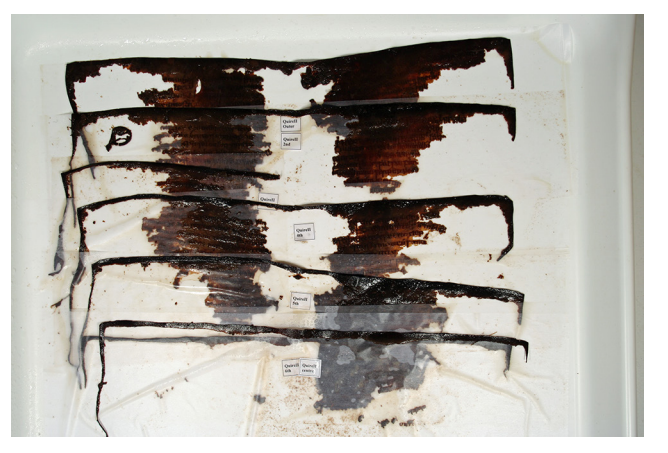
Fig. 3. Bifolia of quire two separated and ready for cleaning.

The first task prior to removal was to study the small area of extant backfolds. As these were in-situ they gave some clue to the original make-up of any given quire, also some codicological detail could be extracted such as the use of singletons or inserted folios. This proved to be a difficult and time consuming task but essential if we were to successfully establish a collation map of the manuscript. It should be remembered that even though we had a well-known and recorded text in the Psalms, we had several folio fragments where no writing had survived and only its position in the quire gave any clue to its identification. The physical position of the text block very much dictated the order of dismantling, and it was approached layer by layer, searching for natural divisions between the clumps of material, this usually occurring between quires. A thin slip of printers plate, cut to approximate the width of the piece in question was covered with a fold of silicone Mylar® and slowly eased between, the spraying with deionized water of the separation point assisted the transmission and reduced surface friction. This process continued until the delineation between the layers was no longer in evidence, and at this point the material, which was at a more advanced stage of deterioration, had become a single mass of gelatinised vellum, surviving letters and bog material, containing plant roots, seed pods and degraded plant material.