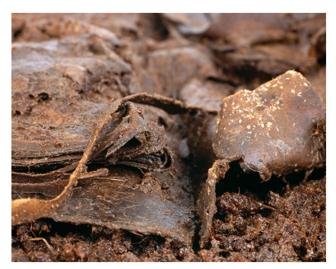
Fig. 2. A view of some surviving backfolds in-situ.

bog. Also, typically organic material survives better here than in soil, research suggesting that sphagnum moss, a component part of a peat bog plays a major role in this process. It has the ability to immobilise microorganisms and according to Terence Painter<sup>11</sup>, produces an antibiotic substance called sphagnan that bind with proteins on the surface<sup>12</sup>. The concern was that by maintaining the saturated levels by spraying with de-ionized water the effectiveness of the bog water was diluted each time. Fortunately we saw no such growth during any stage of the work (fig. 2).