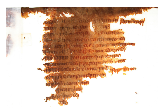
Fig. 4. Folio 13r after cleaning still saturated.

direct contact. When nearing the end of a wet stage cleaning, denatured alcohol would be introduced in solution in order to introduce the vellum to the solvent that would later be employed in the de-watering process