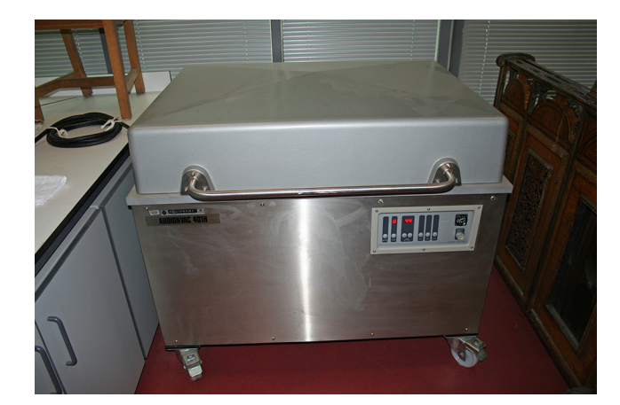
Fig. 10. Audionvac 401H vacuum m/c.