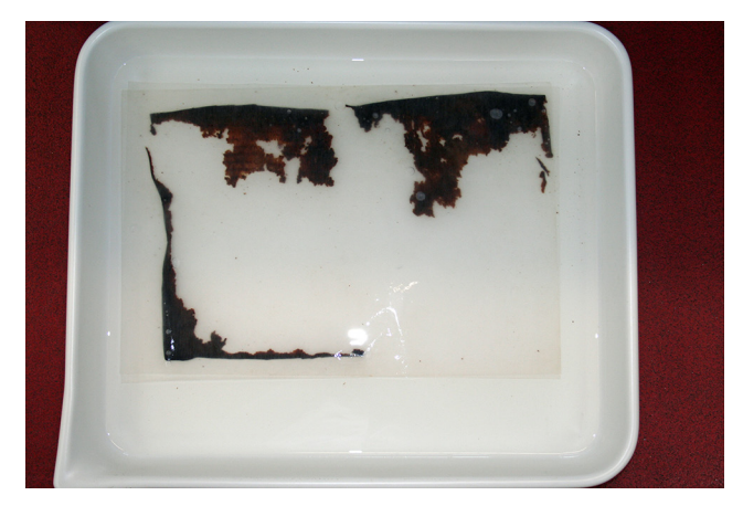
Fig. 9. Solvent exchange bath containing with f47v-56r to view.