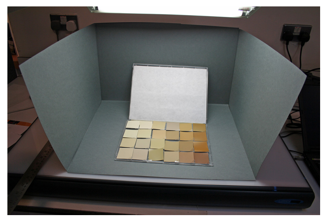
Fig. 7. Colour value station.

Due to the fast evaporation rates of all the other solvents it was not deemed worthwhile to test these through vacuum freeze-drying.