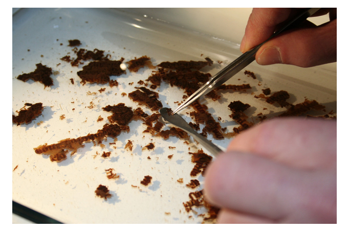
Fig. 11. Smaller fragments of vellum under conservation treatment.

The end product is stable and reasonably robust but with no fold endurance. Although in appearance the stabilised fragments with their muddy brown colour and ragged edges might tempt you to believe that it is no longer vellum. I was reminded on one occasion that this is not the case<sup>18</sup>.