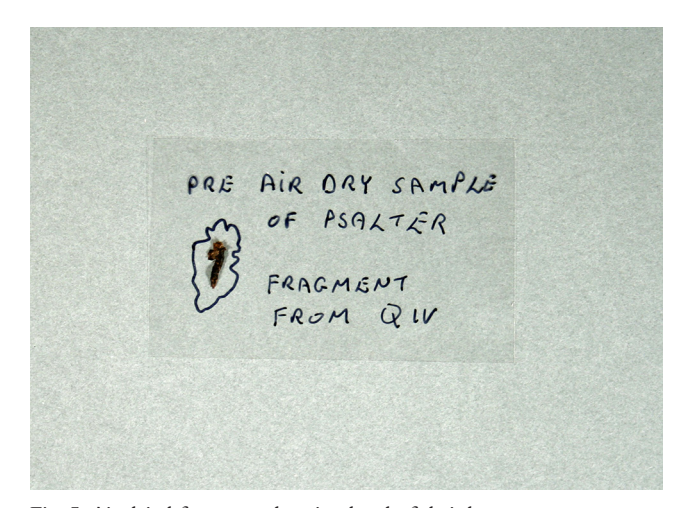
Fig. 5. Air dried fragment showing level of shrinkage.

One of the difficulties of trying to discover how best to dry out the vellum was the lack of material on which to test any possible solutions. The unique nature of the problem also meant there was little to nothing in the way of previous published material on the subject. In order to address the first issue some discarded vellum flyleaves from a late 18th century binding were prepared by hydrating between saturated