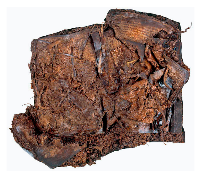
Fig. 1. The Faddan More Psalter after its retrieval from the bog.