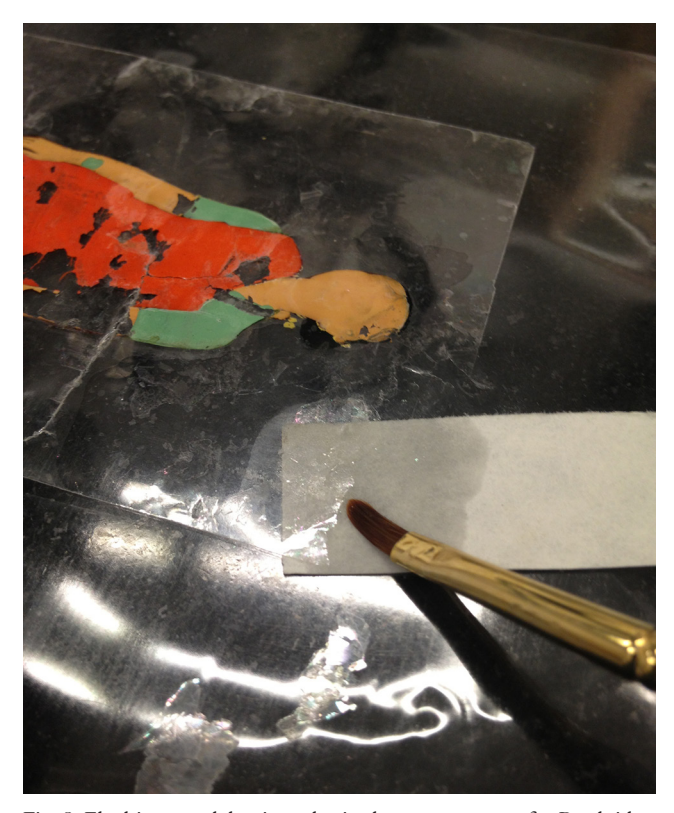
Fig. 8. Flushing out delaminated mica layers to prepare for Paraloid B-72 and BEVA 371 film repairs. Painting 5.2. During treatment.

BEVA 371 film proved to be a fast, easy, and visually compatible repair material for filling losses and bridging simple breaks without overlapping mica (fig. 9). Sold in rolls, BEVA 371 film is a dried transparent layer of thermoplastic, elastomeric polymers sandwiched between protective outer layers of 4-mil silicone release paper and 1.5-mil Mylar (Berger 1975; Jamison et al 2010). The BEVA 371 film was customshaped with scissors to cover breaks and losses. The paper layer was peeled off and the repair was placed adhesive-side down on the verso and set in place with a heated tool at low heat (150°F). The heated tool was regulated with a rheostat