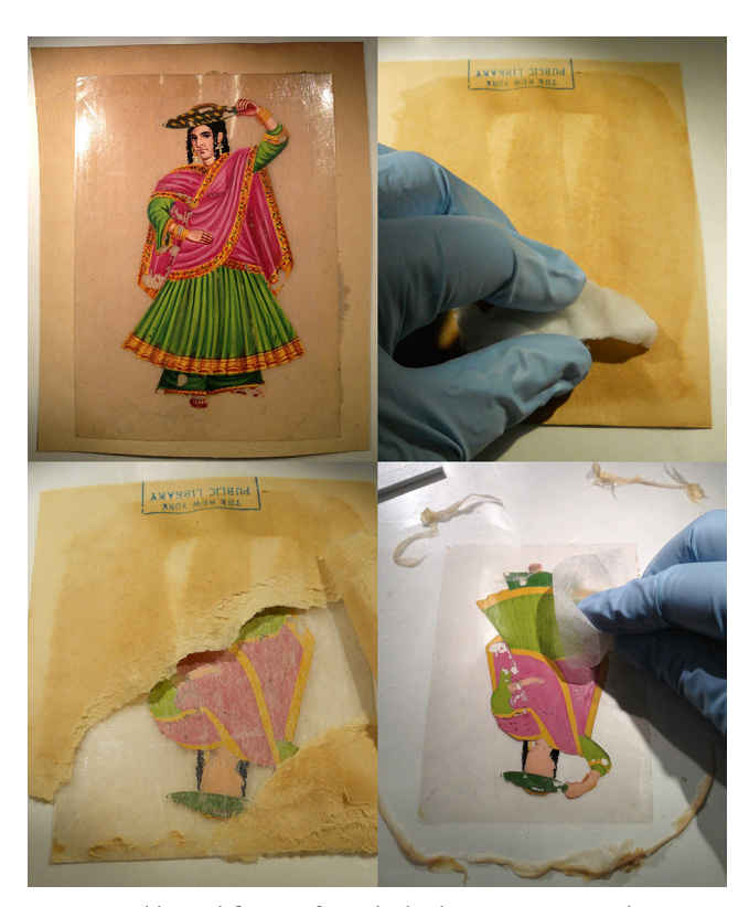
Fig. 7. Local humidification from the back to remove paper linings and adhesive residues. Painting 23.2. During treatment.