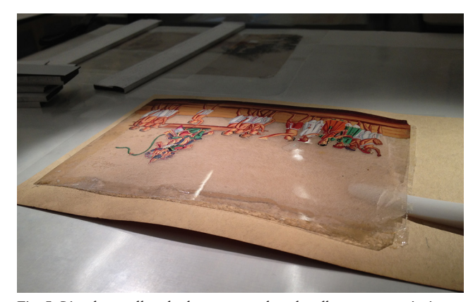
Fig. 5. Lined overall and edge-mounted to the album page, painting 16.1 was partially detached from the album page. During treatment.

suggesting the occurrence of earlier undocumented, but well-intentioned, "tidying."