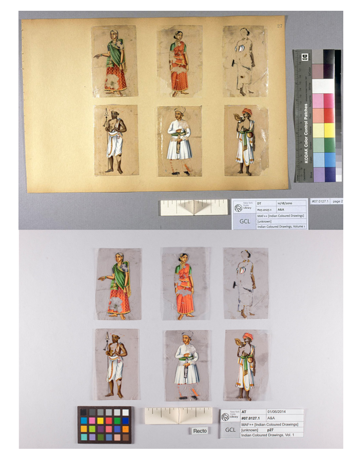
Fig. 2. Surface grime, paint loss, and mica damage. Page 27. During (top) and after (bottom) treatment.

The paintings were executed in gouache, opaque pigment-based watercolors with fillers of chalk or gypsum (Ash 1985; Hansen 1993). Layering techniques and color grounds