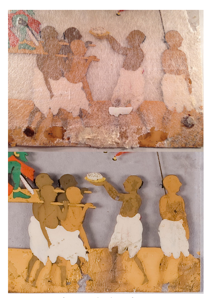
Fig. 6. Loose paint fragment and evidence of previous mounting methods. Painting 7.1. During (top) and after (bottom) treatment.