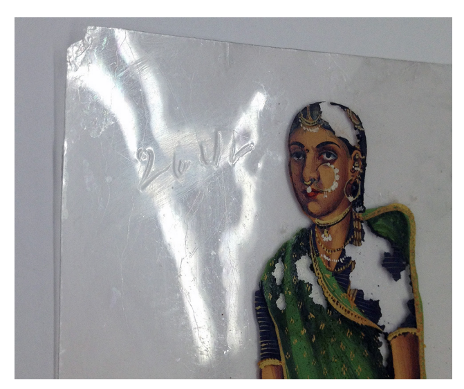
Fig. 3. Alphanumeric identifier "26UL" at top left corner in raking light. Painting 27.1. During treatment.