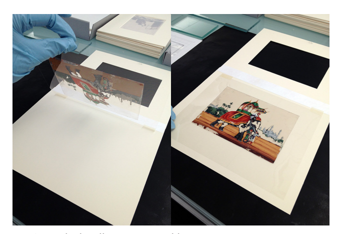
Fig. 12. Mylar handling mount enables access to verso in storage mat. Painting 4.3. During treatment.

platforms like Facebook, Twitter, Vine, Pinterest, and Tumblr. Images and short videos of the digitization process were shared on Twitter by the Goldsmith Conservation Laboratory<sup>2,3</sup> and on Instagram by the author<sup>4</sup>, principal photographer Peter Riesett<sup>5</sup>, and New York Public Library<sup>6</sup> social media feeds. Outreach efforts reinforce interdepartmental collaboration, demonstrate responsible stewardship of NYPL resources, and promote cultural heritage awareness to the public.