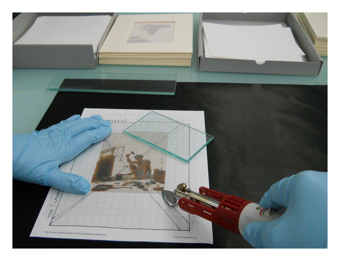
Fig. 11. Using a heated tool to activate Beva 371 film and attach treated mica painting to Mylar handling mount. Painting 4.2. During treatment.