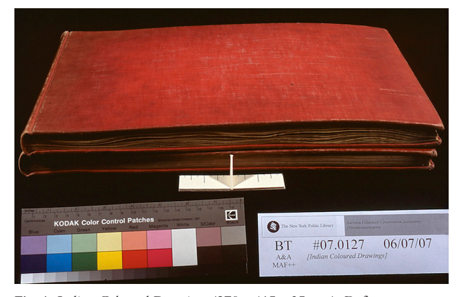
Fig. 1. Indian Coloured Drawings (270 x 415 x 35mm). Before treatment from tail. n.a., n.d. NYPL MAF++ (Indian coloured drawings).

The contents of Indian Coloured Drawings are thematically separated by format into two volumes of original and printed material related to 19th century Indian costumes, occupations, religious ceremonies, and historical scenes (fig. 1). Volume One contained 135 opaque watercolor paintings on small mica supports measuring an average 115x150mm.