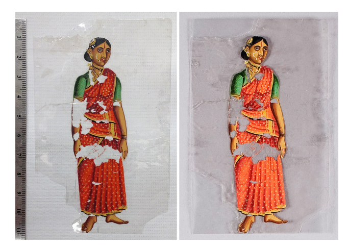
Fig. 9. Mica repairs and fills with Paraloid B-72 and BEVA 371 film. Painting 27.2. During (left) and after (right) treatment.

and regularly tested using a mercury thermometer to ensure consistent temperatures. Silicone release Mylar was used as a barrier. The 1.5-mil Mylar backing already present on the film was compatible with the thickness of the mica supports and was used for loss compensations. Excess film was trimmed with scissors or a scalpel. The BEVA was swelled from the recto with ethanol and gently rolled off with a cotton swab or