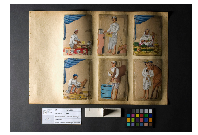
Fig. 4. Overall planar distortion, raking light. Page 18. During treatment.

The linings and edge-mounting proved to be ruinous. Humidity and temperature fluctuations in ambient storage conditions caused the paint on the recto and the paste/ paper layers on the verso to expand and contract while the mica mineral support remained inert. Crowding on the page enhanced planar distortion of the paper album pages. The grain direction of the paper encouraged cockling along the vertical axis, bowing the micas (fig. 4). The layered crystalline structure of the mica easily cleaved in thin layers, resulting in complex breaks, shearing, and paint loss (fig. 5). Few loose paint or mica fragments were present in the album gutters,