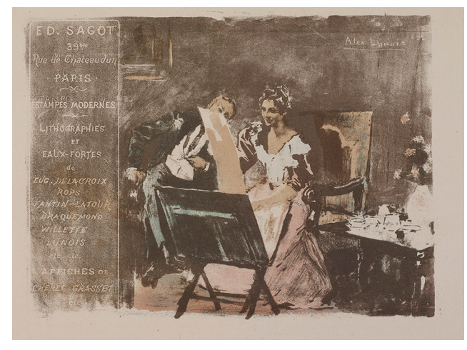
Fig. 4. A postcard advertising Edmond Sagot's shop.

For those less inclined to remove Lautrec posters directly from walls, or pay off afficheurs, there was soon a third option, the poster dealer. The most widely known poster dealer in the 1890s was Edmond Sagot, a postcard advertising his shop can be seen in figure 4. Nicolas and Mireille Romand, descendants of Edmond Sagot, continue to operate two commercial galleries in Paris, Galerie Sagot-Le Garrec, and Galerie Documents. Throughout the 1890s and into the 20th century Edmond Sagot sold posters directly from the printers to private collectors and institutions in Paris and around the world. The original Sagot poster archive is comprised of index cards listing the name of the poster, who the poster was sold to and the cost, it is a truly remarkable resource. Even with the aid of poster dealing and private collecting it is still extraordinary that so many Belle Époque posters have survived into the 21st century, especially considering their ephemeral nature and the use of poor quality paper; certainly, the practice of lining the posters with fabric has saved many of them from ruin.