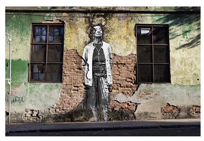
Fig. 12. The Wrinkles of a City, La Havana, Leda Antonia Machado, Cuba, JR, 2012, wheatpasted print, unknown dimensions.