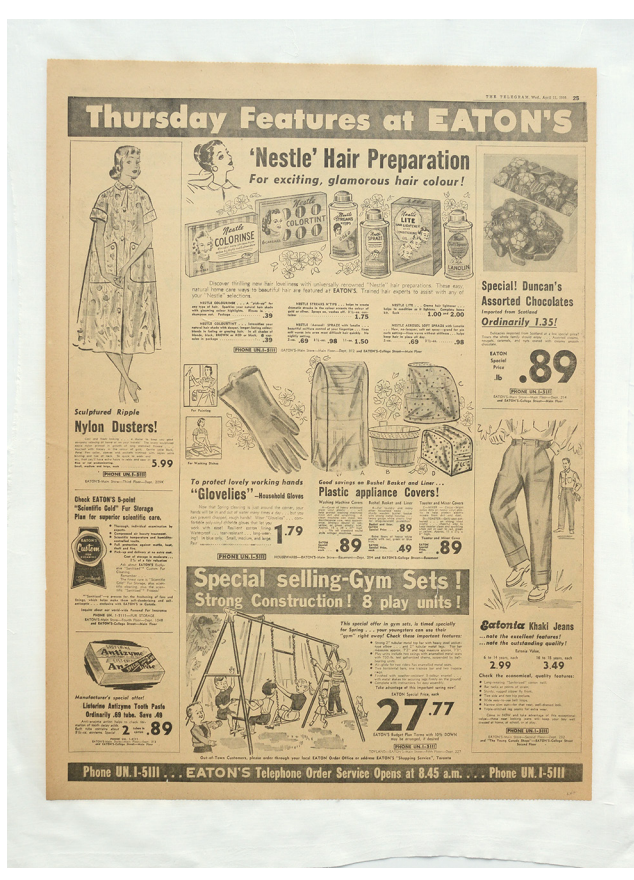
Fig. 11. Newsprint mock-up using wheat starch paste and white étamine

Appendix. The relining treatment for Le Photographe Sescau (1896) was completed using Japanese paper, and the relining treatment for L'Aube was completed using "étamine". Equivalent techniques, outlined in the Appendix, were used to line both posters. Due to time constraints, and the postponement of a major exhibition to showcase the Ross R. Scott and Donald R. Muller Collection, only Le Photographe Sescau (1896) and L'Aube (1896) were conserved using these methods. The two remaining posters to be treated, Aristide Bruant (1893) and Babylone d'Allemagne (1894) are stable and will undergo further conservation treatments as time permits.