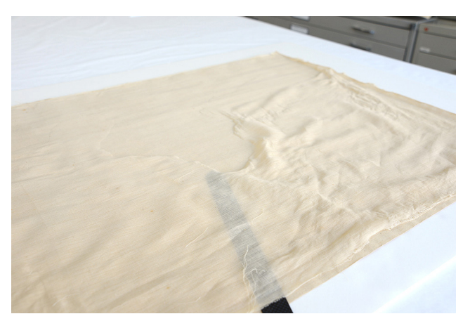
Fig. 9. Jeff Peachey's Carbon Fiber Lifter used to remove a fabric lining from a poster.