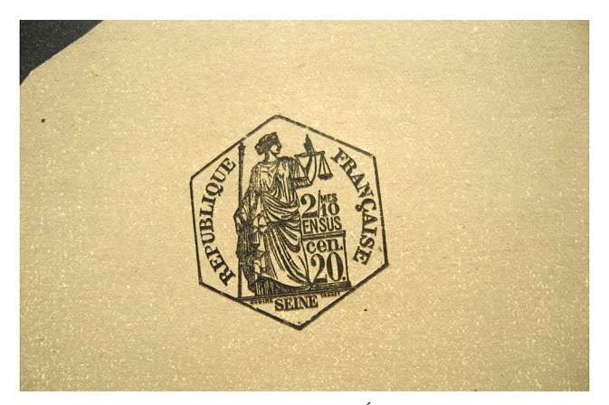
Fig. 3. A typical tax stamp found on Belle Époque posters.

been pasted for a short time or while it's raining, or when the posters have been slapped over a thick layer and become like cardboard—it's quite easy to get them off the wall: but watch out for the cops...Once you're back home—what to do? Wash them well, then dry them on the line, patch up the tears and voilà! Pin your booty on the walls of your apartment—your apartment where, of course, your landlord lets the wallpaper hang in ribbons. A Lautrec or Chéret at home: that's the thing that will make it gleam! Your place will light up with a riot of color and fun. These posters are really class (Halperin 1988, 229–31).<sup>4</sup>