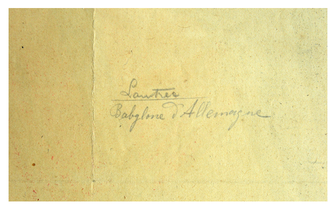
Fig. 2. A collector's notation adjacent to central folds on the verso of a poster.

Furthermore, I have an idea in the back of my mind which I am going to share with you right away. These posters are really fine...why not take advantage of them? If they've only