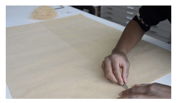
Fig. 10. The thread-by-thread fabric lining removal process.