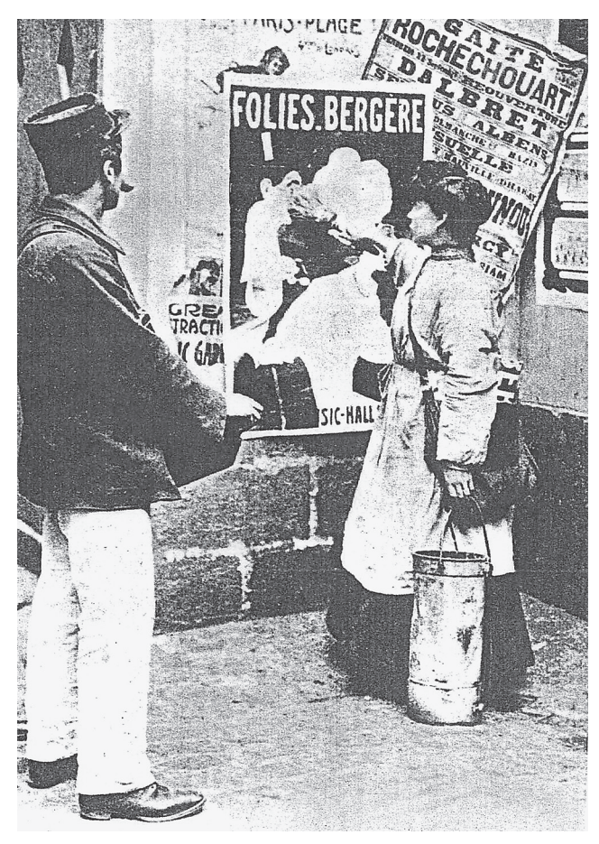
Fig. 1. A female afficheur adhering a poster to an outdoor wall.