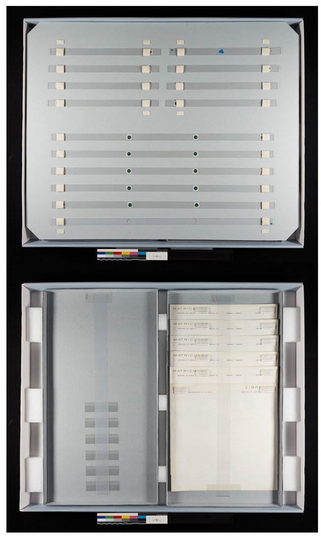
Fig. 4. (Top) upper level of storage box showing Vivak® strips with embedded magnets secured with twill tape; (Bottom) lower level of storage box showing removable trays holding folios with Mylar clips and polyethylene strap.