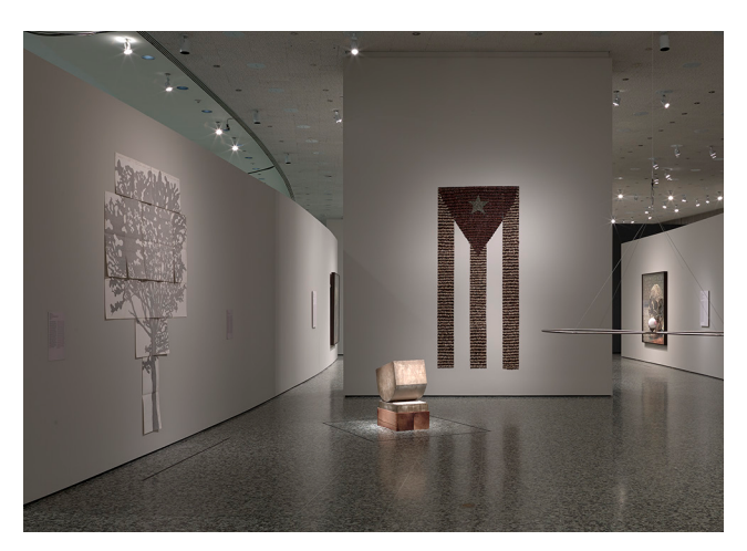
Fig. 1. Installation view of Contingent Beauty: Contemporary Art from Latin America , 11/22/2015-2/28/2016 at the Museum of Fine Arts, Houston. (Left) Johanna Calle, Perímetros (Urapán) , 2012, typed text on notarial ledger book paper, 280 x 200 cm.

In preparation for the Museum of Fine Arts, Houston (MFAH) exhibition Contingent Beauty: Contemporary Art from Latin America , paper conservators at the MFAH developed a mounting system with magnets to display Johanna Calle's Perímetros (Urapán) , 2012, a 12-part assemblage of typed text on ledger book pages positioned on a wall to depict a tree (fig. 1). The mounting system provided a clean, invisible aesthetic, and was constructed to be reusable for future display without significantly increasing storage space. Spun polyester-web pockets were adhered to the verso of each folio with BEVA 371 film (two or four pockets were adhered to each folio depending on the orientation) (fig. 2). Each set of pockets held a thin PETG (Vivak®) strip with embedded rare earth magnets (1/2 in. diameter x 1/16 in. thickness, N-42 strength) (fig. 3). Metal screws were drilled into the