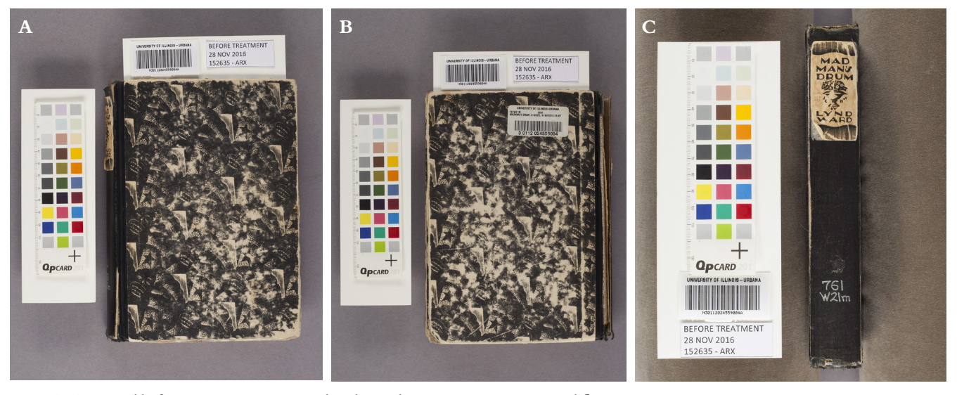
Fig. 6. (a-c) Limited before treatment images used in the medium-rare conservation workflow.

removal was considered too high risk to be completed without the supervision or direct involvement of a conservator. Likewise, any items that required the paring, tooling, or specialized working of leather would have to be excluded as well. Moreover, any items that featured compound or problematic material features such as parchment and certain photographic emulsions were also not considered for medium-rare treatment, in part due to their difficult material features (rather than the complexity of the treatment approach), which made them risky to work with without close supervision from a conservator (figs. 8, 9).