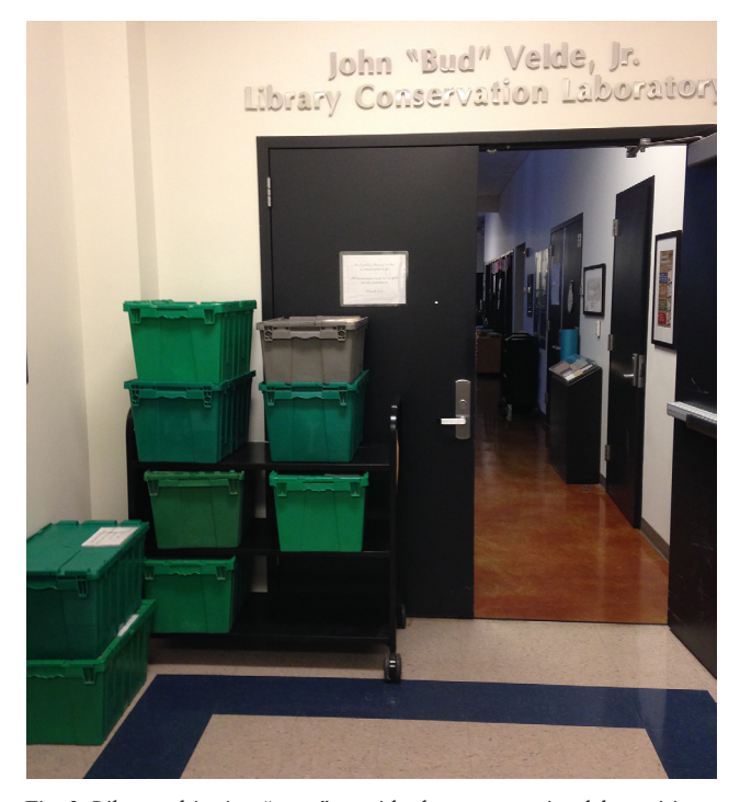
Fig. 3. Library shipping "totes" outside the conservation lab awaiting transport.

is able to pull an item's bibliographic record from Voyager the library's cataloging software—via barcode scanning. Practically speaking, this meant that catalog information could be automatically populated into our documentation forms