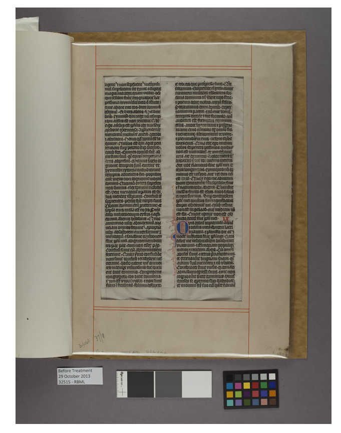
Fig. 9. Because the organic structure of parchment makes it highly reactive to its surrounding and can often present challenges in treatment, it also was excluded from medium-rare.

Almost immediately, staff began to observe some major benefits as a result of the addition of the medium-rare workflow. Working relationships with collection managers around the