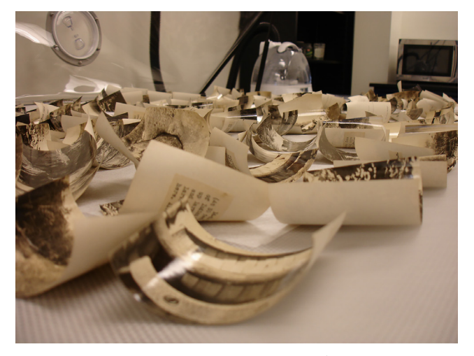
Fig. 8. A collection of curling photos in need of flattening and rehousing. Although fairly straightforward, this treatment approach would not be identified for the medium-rare workflow due to the risks and experience required for handling photographic emulsions.

throughout the library. Conservators began "plugging" medium-rare conservation as a potential treatment option during routine priority meetings among various collections, simultaneously noting any objects that might be appropriate for transportation to the lab for medium-rare treatment. In the early stages of implementation, conservators operated as the primary point of contact with the collection managers. They established review meetings to look at objects and suggest treatment options, using each object as an example to explain the differences between the possible workflows. When medium-rare treatments were completed for one collection, conservators shared the before and after documentation with curators from other collections to give them a sense of what could be expected, as well as to alleviate any resistance born from protective instincts.