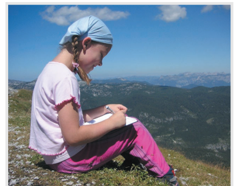
1 Writing is a creative task for all generations.

The subjects of articles or notes also cover the creation, preservation and conservation of cultural heritage on paper and related materials but do not include research. Such works come under the headings of 'A Conservation Project', 'Conservation Techniques', 'New materials', 'Literature review', etc. These publications are not peer-reviewed and have a more current or news value.