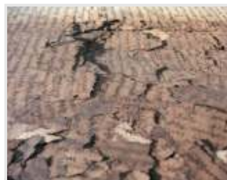
4 Describing a problem with convincing photos raises the interest.