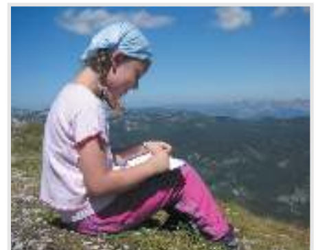
1 Writing is a creative task for all generations.

The subjects of articles or notes also cover the creation, preservation and conservation of cultural heritage on paper and related materials but do not include research. Such works come under the headings of 'A Conservation Project', 'Conservation Techniques', 'New materials', 'Literature review', etc. These publications are not peer-reviewed and have a more current or news value.