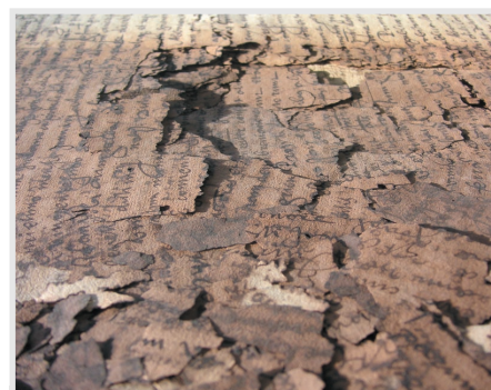
4 Describing a problem with convincing photos raises the interest.