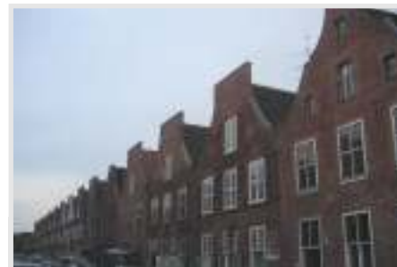
7 One could think that this is a Dutch street should the figure caption be inadequate; the street is actually situated in Potsdam, Germany.