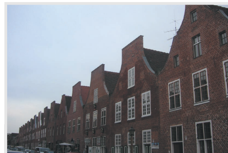
7 One could think that this is a Dutch street should the figure caption be inadequate; the street is actually situated in Potsdam, Germany.