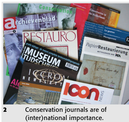
2 Conservation journals are of (inter)national importance.

The referees judge if a paper makes a new and important contribution to the understanding of any area of paper conservation or related subjects. Based on the evaluation crite-