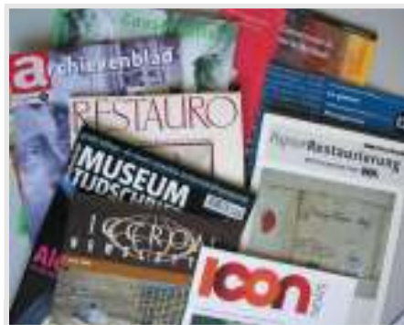
2 Conservation journals are of (inter)national importance.

The referees judge if a paper makes a new and important contribution to the understanding of any area of paper conservation or related subjects. Based on the evaluation crite-