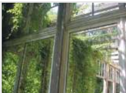
5 Figures might be attractive but are useless if they have no relation to the subject of the paper.

Say that the result of an EDX analysis proved that a drawing ink contained the elements Fe and Ca as well as traces of K and S. Then the discussion section is the right place to argue that inks containing Fe and S are likely to be iron gall inks due to iron sulfate being a major ingredient. This statement should be supported with a reference. However other inks as, for instance, Bistre, could also contain