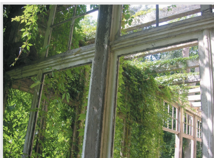
5 Figures might be attractive but are useless if they have no relation to the subject of the paper.

Say that the result of an EDX analysis proved that a drawing ink contained the elements Fe and Ca as well as traces of K and S. Then the discussion section is the right place to argue that inks containing Fe and S are likely to be iron gall inks due to iron sulfate being a major ingredient. This statement should be supported with a reference. However other inks as, for instance, Bistre, could also contain